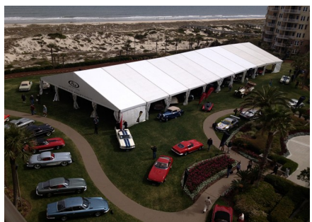
Bird's-eye view of the Amelia Island Concours d'Elegance auction preview