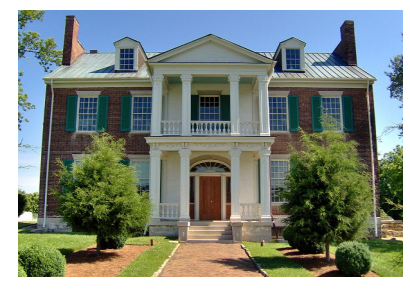
Historic Carnton in Franklin, TN

Updates are ongoing; check our website, www.mbcanashville.org, for news and details