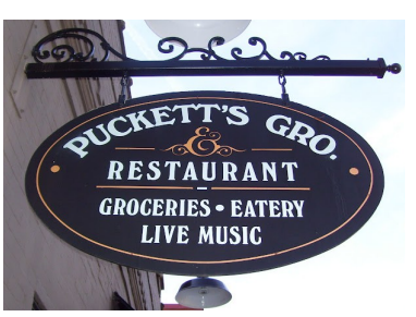
Puckett's Grocery, Franklin