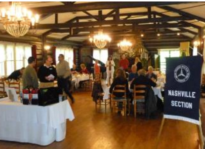
Below, Luxury Imports of