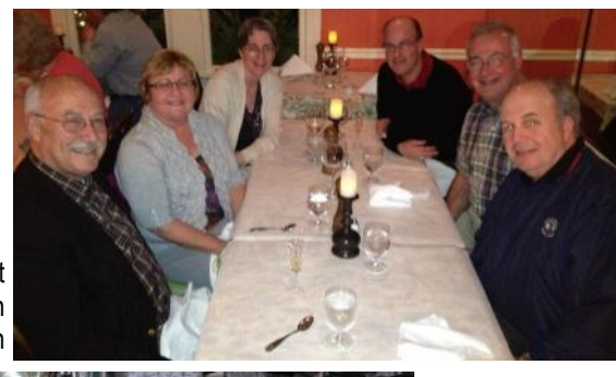
Left, Precision Autohaus in April